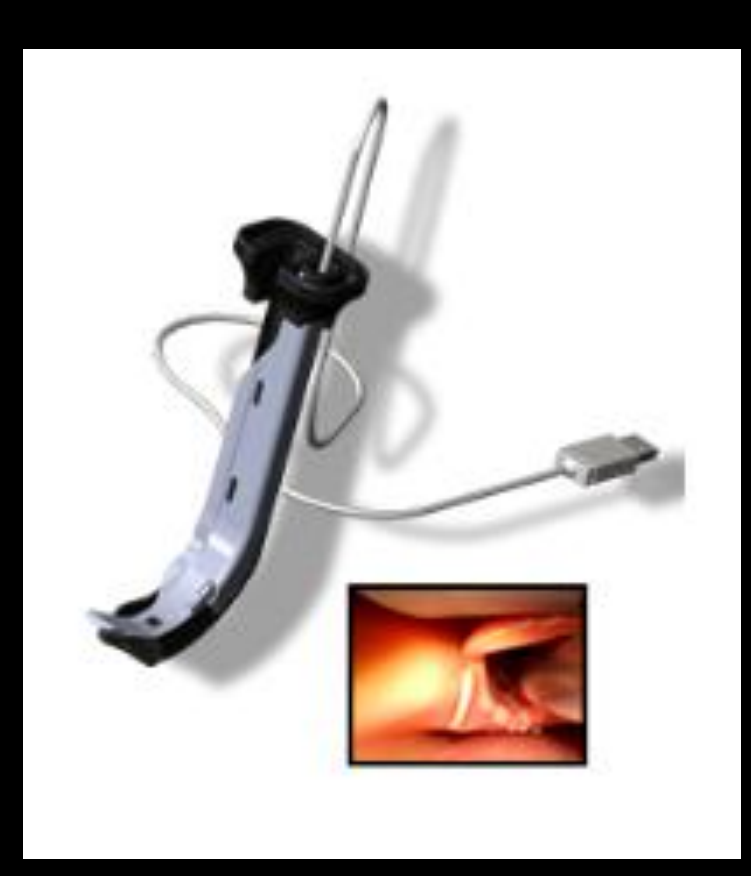
most VL under A$1000, disposable VL under A$100